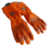
Blastsafe™ IRONGRIP Abrasive blasting