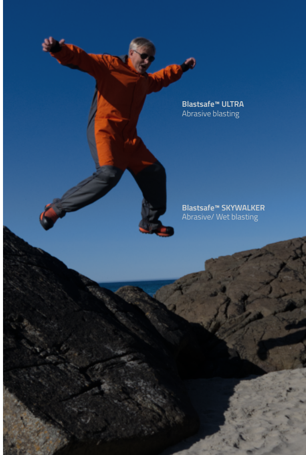
Blastsafe™ ULTRA Abrasive blasting

Kevlar®, Polyester, TPU, Neoprene, Steel and Natural Rubber.